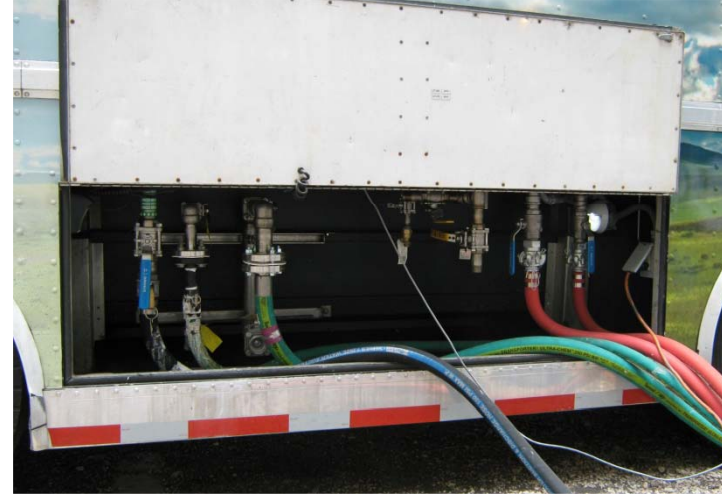
Halogen System Primary Manifold