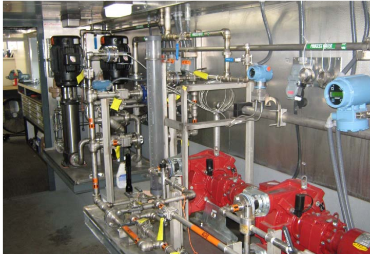
Halogen Mixing Pump and Distribution Pumps