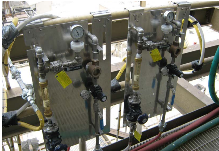
Individual Lance Control