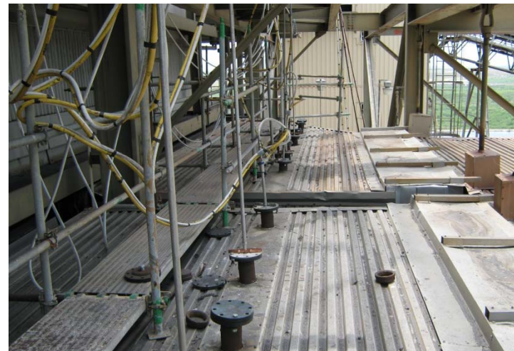
Lance port configuration